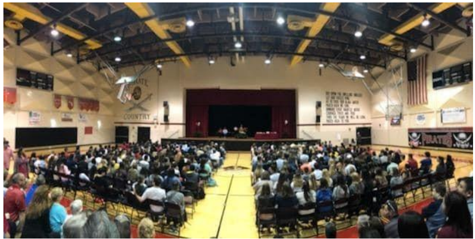
Get Involved and stay Involved Full house at a parent assembly (photo taken August 2019)

6. Provide assistance, training, workshops, events and/or meetings for parents to help them understand the education system, curriculum, standards, state assessments and achievement levels.