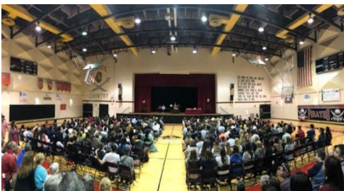
Get Involved and stay Involved Full house at a parent assembly (photo taken August 2019)